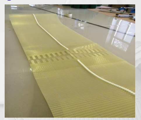
550 WT10 5820 longitudinal joint + V-Guide (confection & loading)