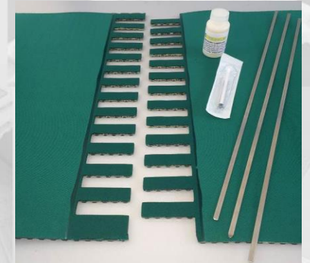
375 WT10 7500 NT+NB (vulcanization – transportation of rubber sheet)

ERO joint® solution is available for all types of conveyor belts.