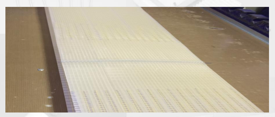
Above: 180 WT10 4730 grinded (vulcanization – transportation of rubber sheet)